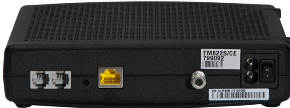
TM822S Back view