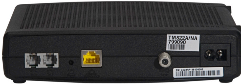
TM822A Back view